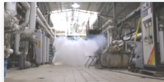
ARS for potential Ammonia leak